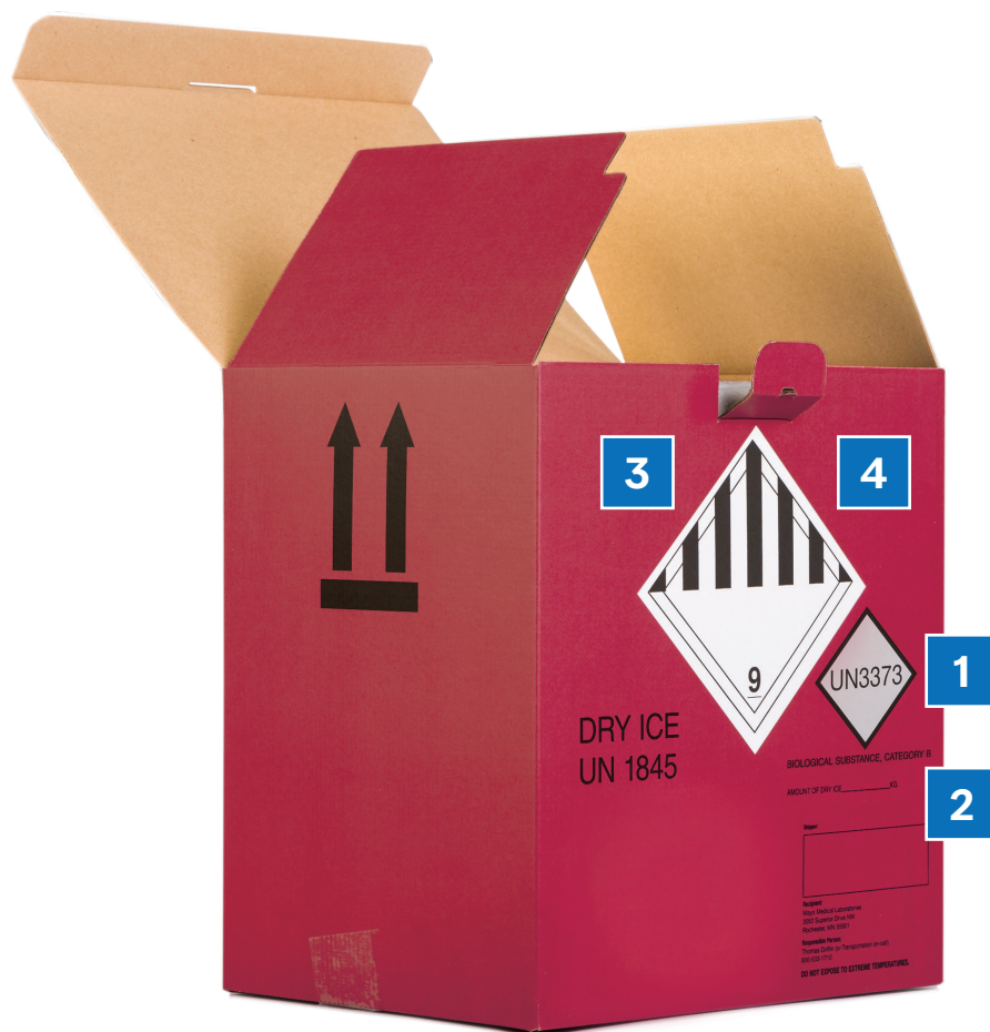
▲ Properly labeled, certified Biological Substance, Category B package