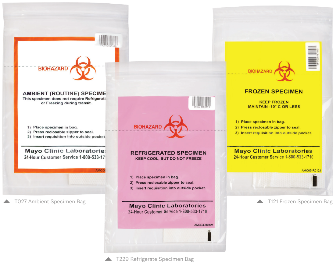
▲ T027 Ambient Specimen Bag

Clients will have specimens ready for pickup in Mayo's color-coded temperature bags. All specimens must be shipped in a leak-proof container regardless of transport temperature. The color-coded bags also contain material that can absorb the full liquid content of the specimens placed inside.