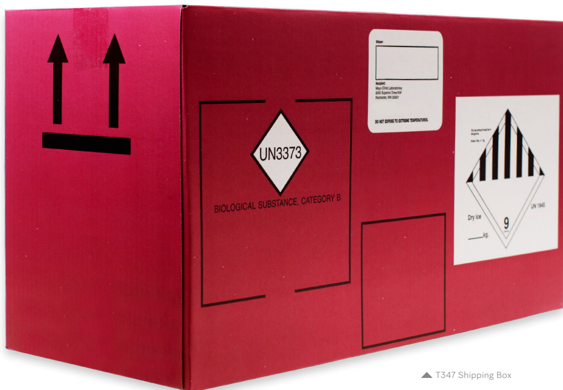
▲ T347 Shipping Box